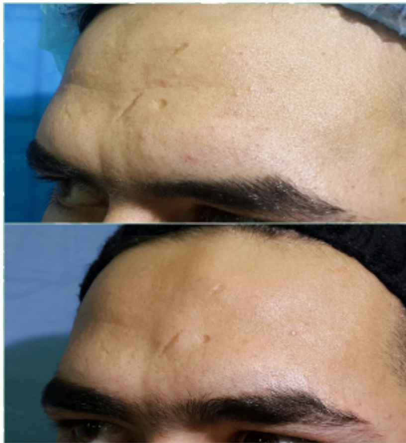
Figure 8 A-B. Pre and postoperative traumatic scar on forehead. with lumpy mass appearance on forehead in picture B .