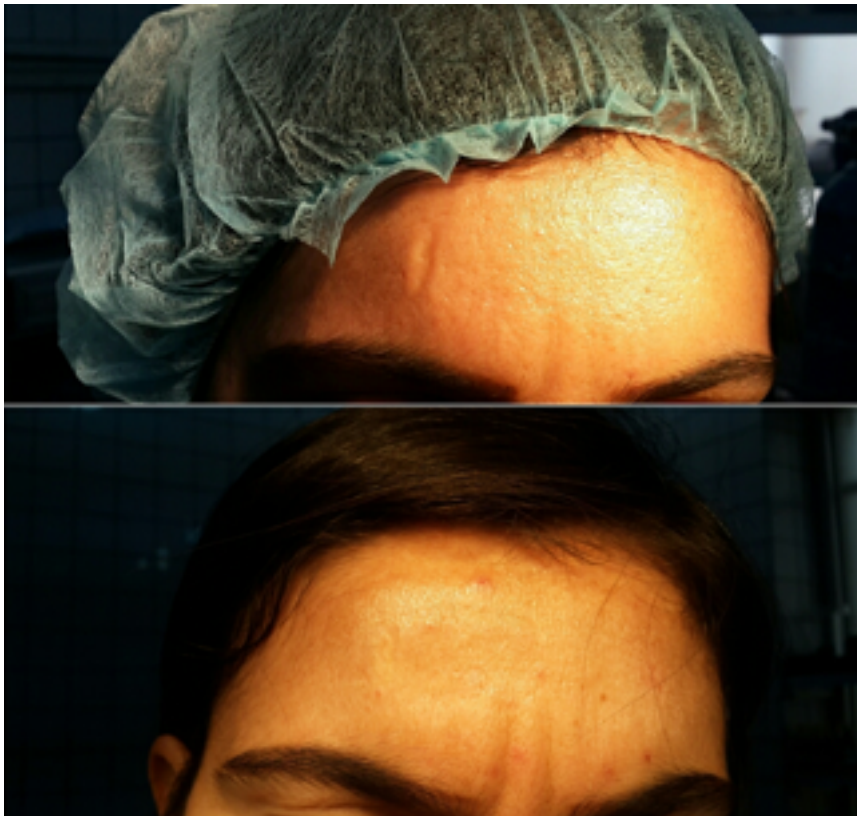
Figure 6 A-B. Pre and postoperative traumatic scar on forehead.