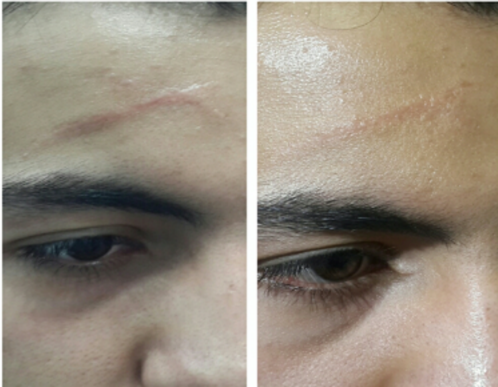
Figure 5 A-B. Pre and postoperative traumatic Scar on forehead.