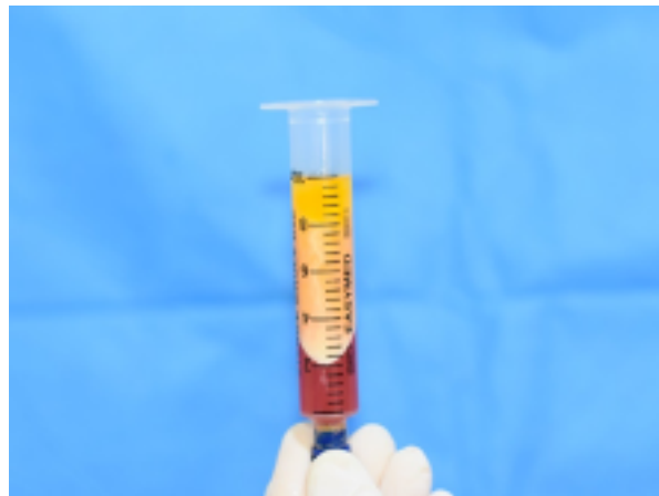
Figure 1 . Note three different layers; oily layer is above; a fatty layer is at middle and lidocaine and RBC at lower layer.

patients and two independent observers (doctors). Two independent doctors (observer component) for assessment of Scar; paid attention to (Vascularization, Pigmentation, Thickness, Relief, Pliability and Surface area), while patients (patient component) were assessed by asking to (Pain, Itching, Color, Stiffness, Thickness and Irregularity) of scar. As shown in Figure (2, 3) assessment carried out from normal scale; number one (1) scale to worst scales number ten (10). At last follow up period in (sixth month) results of follow up (Photos and POSAS) were presented in this study.